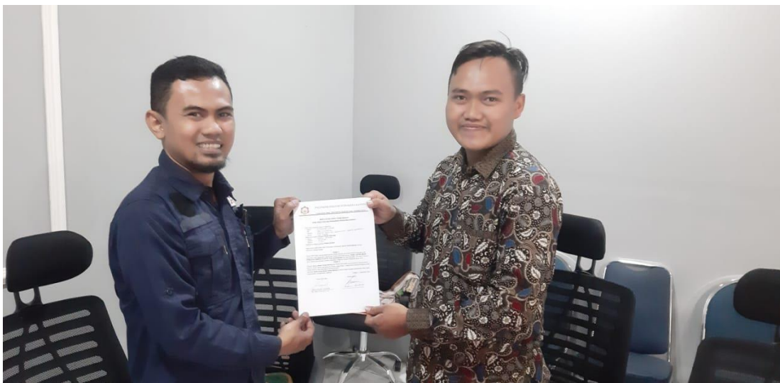
Figure 13. Handover of Documents on Customer Satisfaction Results At TPA Bagendung.