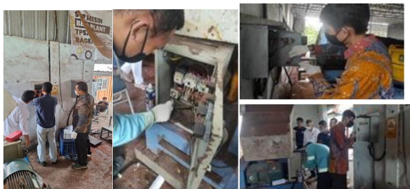
Figure 8. Cleaning of Electrical Panels and Plastic Shredding Machine Control Panels