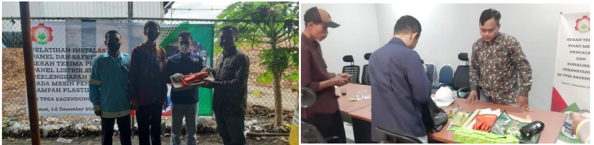
Figure 11. Handover of Goods for Panel Installation and Maintenance Electricity

maintaining the waste chopping machine at TPSA Bagendung. The following is documentation of the results of the activities from the implementation (Figure 11-13).