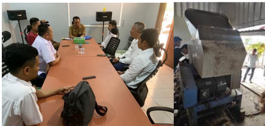
Figure 5. Carrying out A Survey and Study of Problems with Plastic Waste Shredding Machines

The PKM team in the Petrochemical Industry Instrumentation Technology study program conducted a survey of the TPSA Bagendung location involving several students and TPSA Bagendung stakeholders to conduct a study regarding problems at the TPSA. From the survey results, it was found that there was a problem regarding the condition of the waste shredding machine which often tripped when operating. This machine is used as a plastic goods chopper with a production capacity of 10 tons/day, so if this machine experiences problems it will cause delays in waste production. After further study, the waste shredding machine experienced problems due to poor cleanliness of the panels, some of the cable bolts on the electrical equipment were loose, and the MCCB did not match the function of the machine.