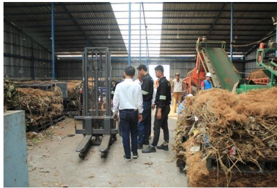
Figure 2. TPSA Bagendung Cilegon Work Location

The BBJP Plant Waste Management Factory was built in collaboration between the Cilegon City Government and PT. PLN Persero aims to recycle city waste into something more productive. BBJP Plant TPSA Bagendung will absorb 30 tons of waste every day which will be processed into coal companion fuel or co-firing for the Suralaya Steam Power Plant (PLTU).