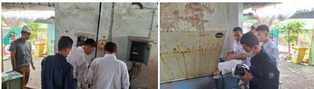
Figure 10. Process of Installing A New MCCB on The Electrical Panel of A Waste Shredder

The amount of current used in the MCCB is still adjusted to the old MCCB, namely 100A, considering the use of a motor drive in the waste chopper machine of 42.5A. The Compact NSX model MCCB device has an adjustable current feature which makes it easier to use the MCCB and can adjust the electrical power requirements of the waste chopper machine and also if abnormal conditions occur. Figure 10. shows the process of replacing old MCCB devices to new models