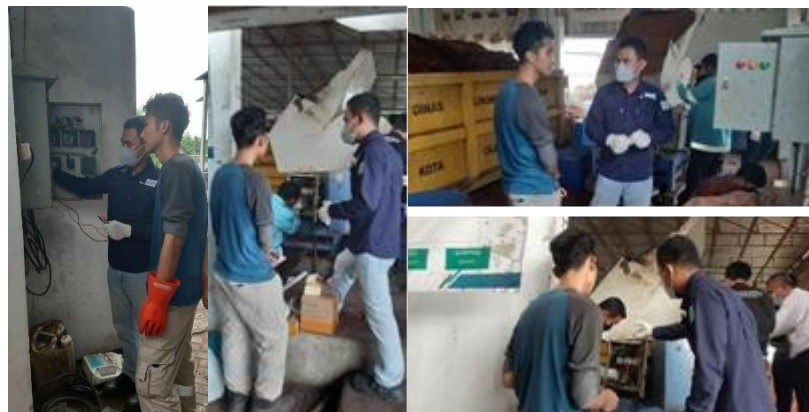
Figure 7. Practical Training for Technicians in The Electrical Panel Area

At the implementation stage, practical training was carried out for technicians at the location of the plastic shredding machine's electrical panel to learn how to maintain and check equipment on the electrical panel as well as cleaning the plastic shredding machine's electrical panel before replacing the MCCB unit (Figure 7). The activity of cleaning of electrical panels and plastic shredding machine control panels can be seen in Figure 8.