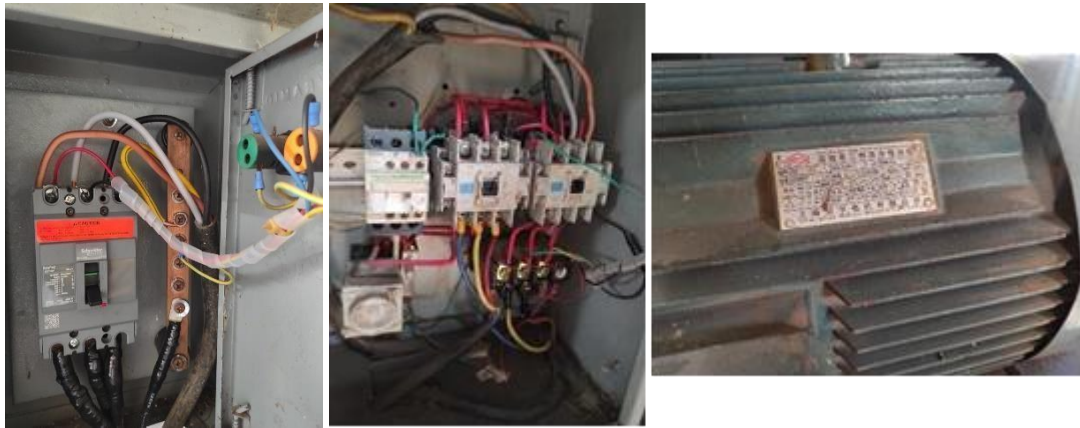
Figure 6. Electrical Panel System, Control Panel, Electric Motor