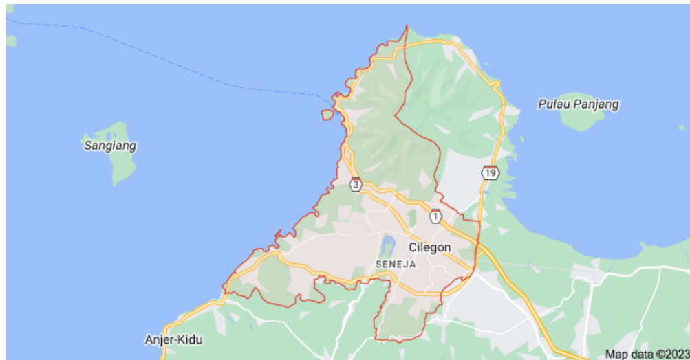
Figure 1. Cilegon City Map

In Cilegon City there is various type vital state objects , including ports _ Merak , Harbor Cigading , Krakatau Steel, PLTU Suralaya , PLTU Krakatau Daya Electricity , Krakatoa Tirta Water Industry , Bridges Strait Sunda and Bonded Strait Sunda . With exists vital object _ naturally economy and well-being the people of Cilegon City will increase. Besides impact positive the of course there is also negative impacts caused wrong the only one pile up waste / rubbish .