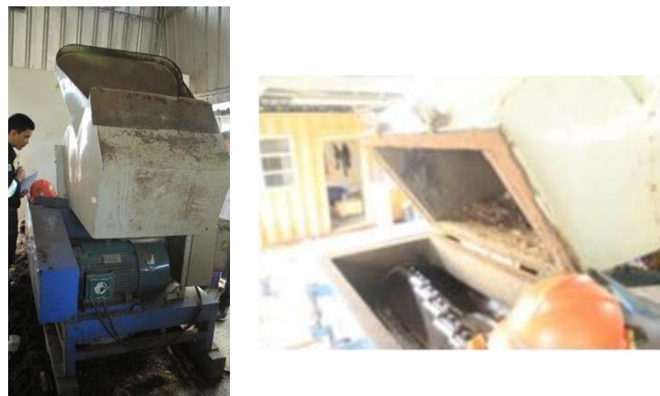
Figure 3. Waste Shredding Machine Producing 10 Tons/Day

In relation to waste recycling, TPSA Bagendung has several shredding machines to be used as waste sorting and shredding media. One of the waste shredding machines can be seen in Figure 3.